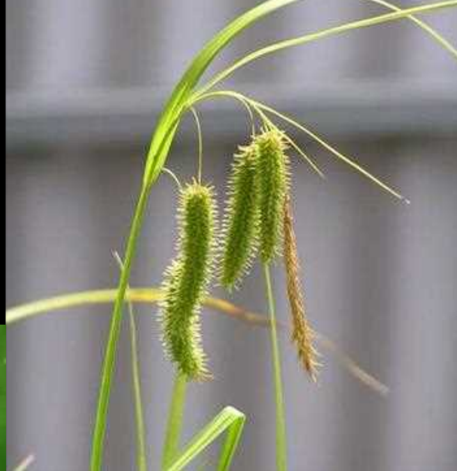
Carex fascicularis Tassel Sedge