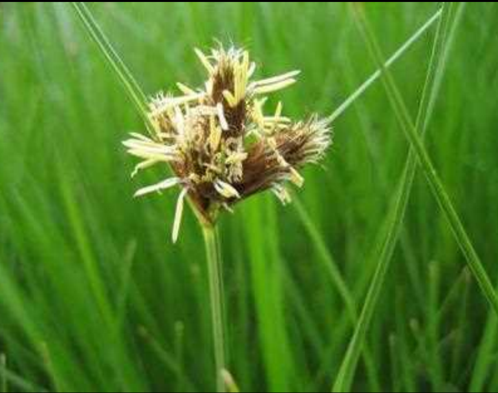
Bolboschoenus caldwellii Marsh Club Rush