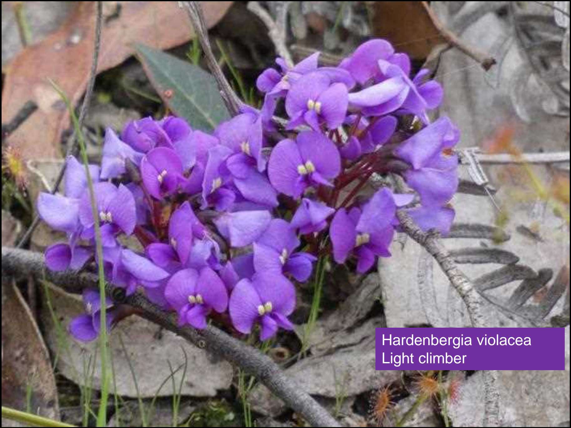
Hardenbergia violacea Light climber