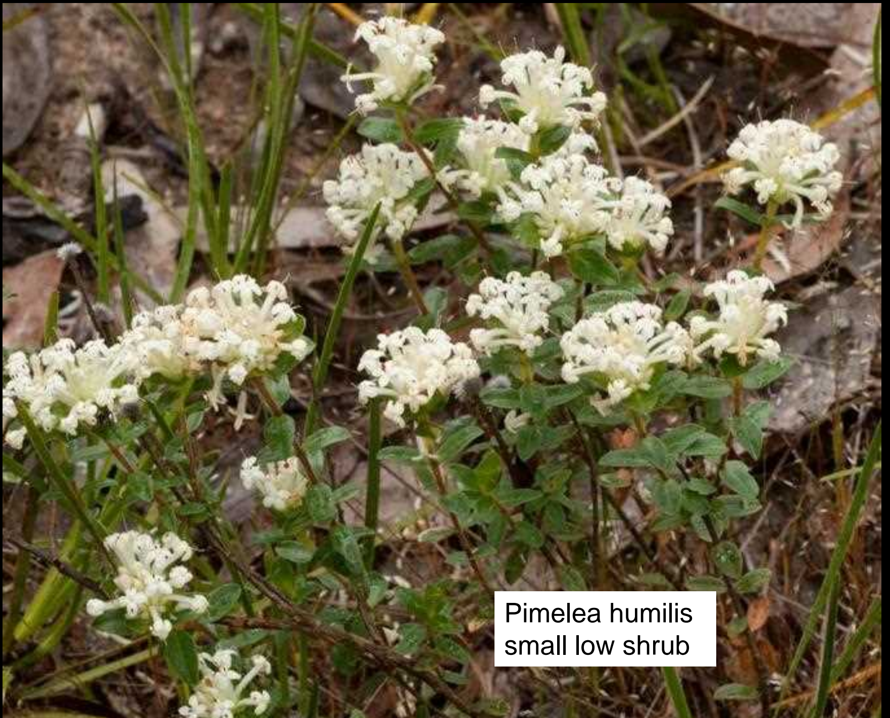
Pimelea humilis small low shrub