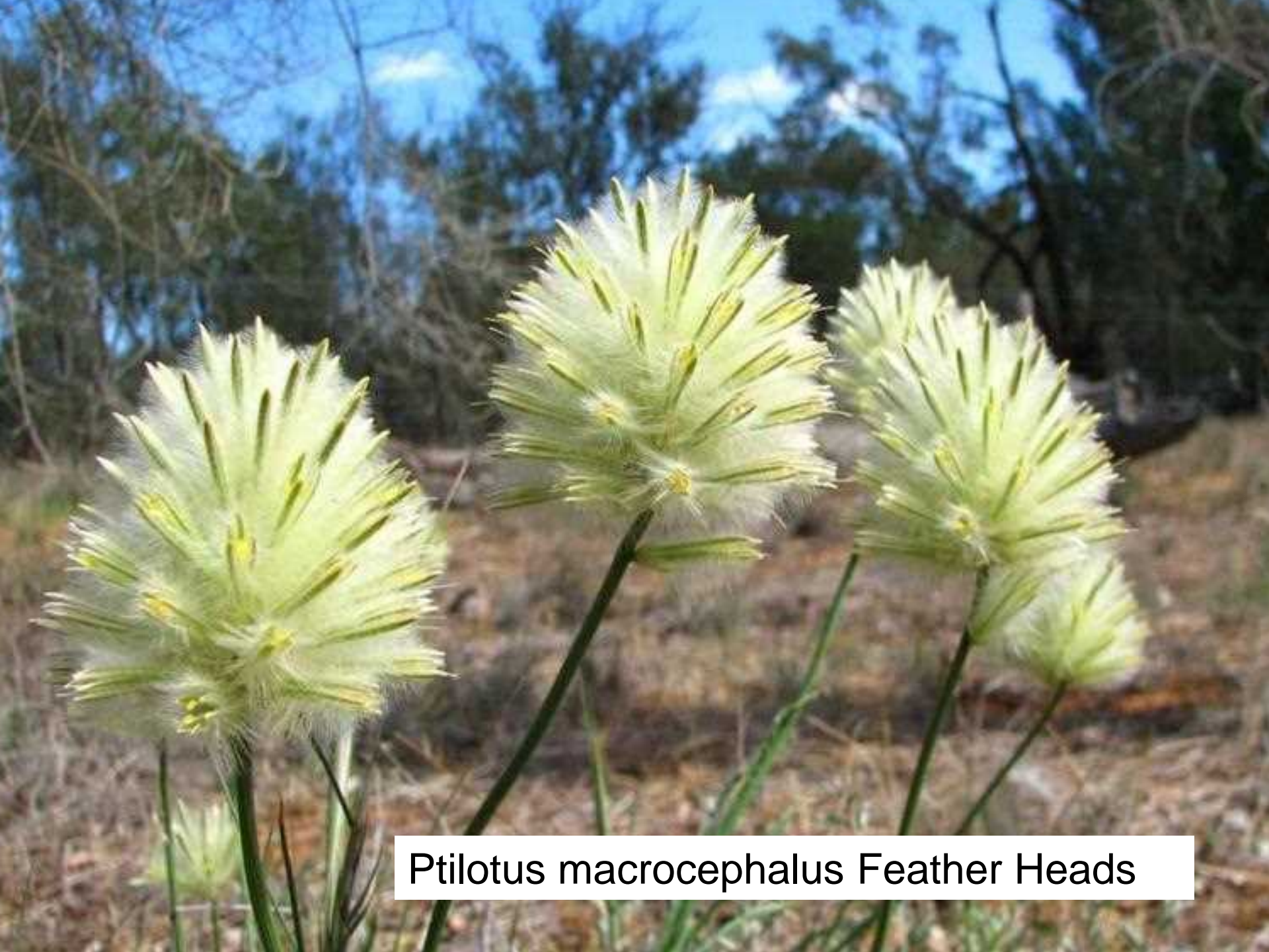
Ptilotus macrocephalus Feather Heads