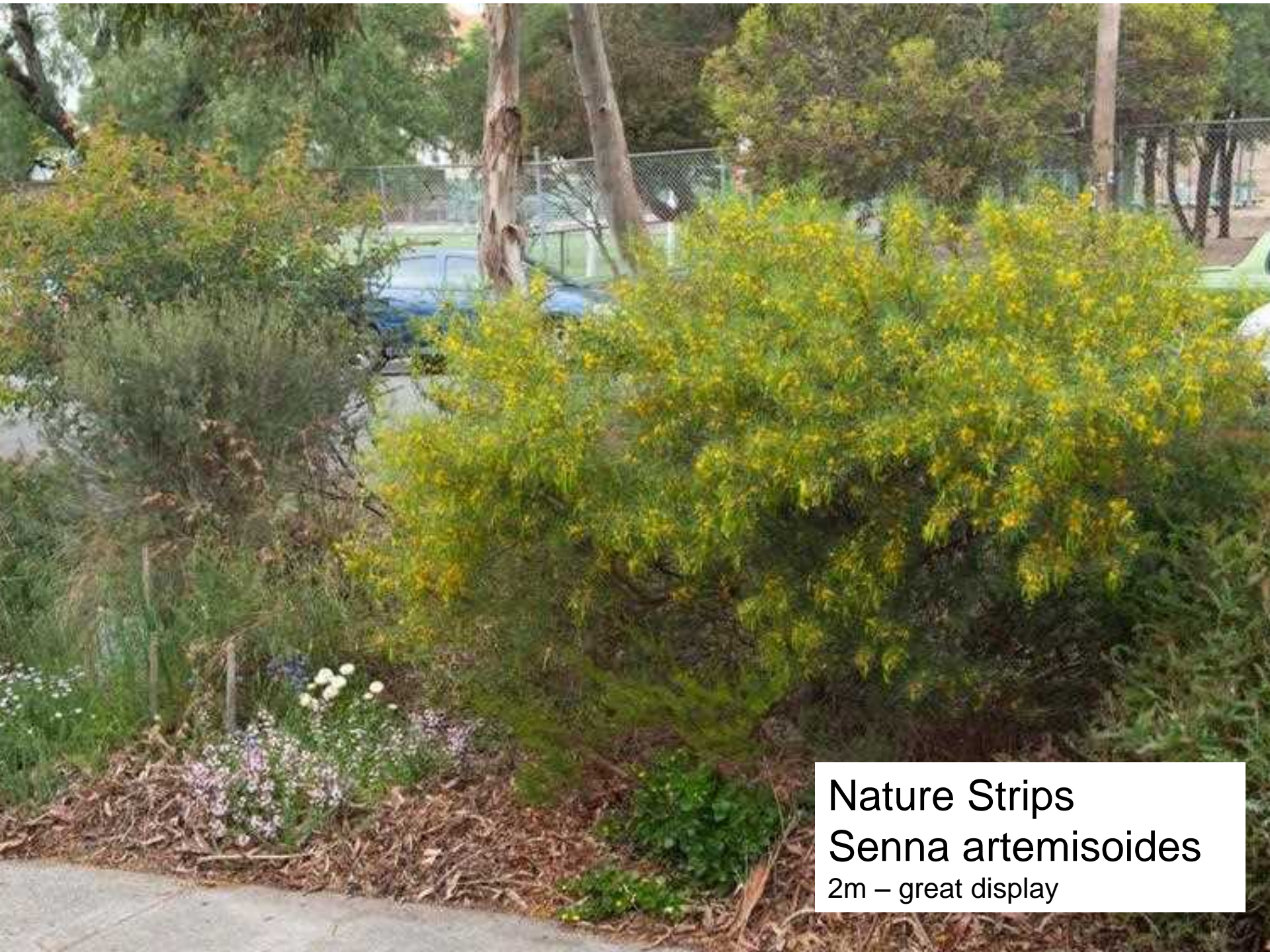
Nature Strips Senna artemisoides 2m – great display