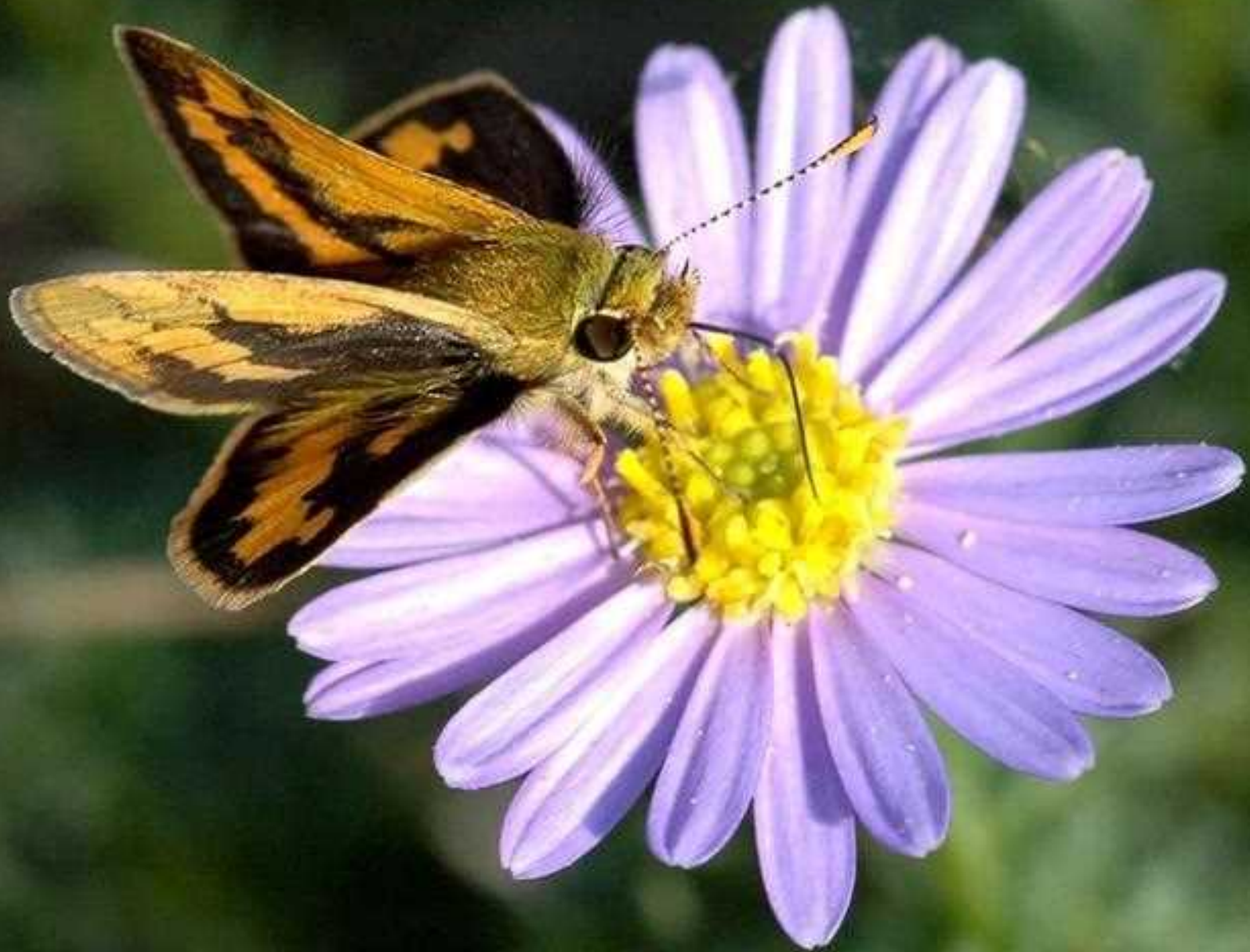
Yellow-banded Dart on Brachyscome multifida