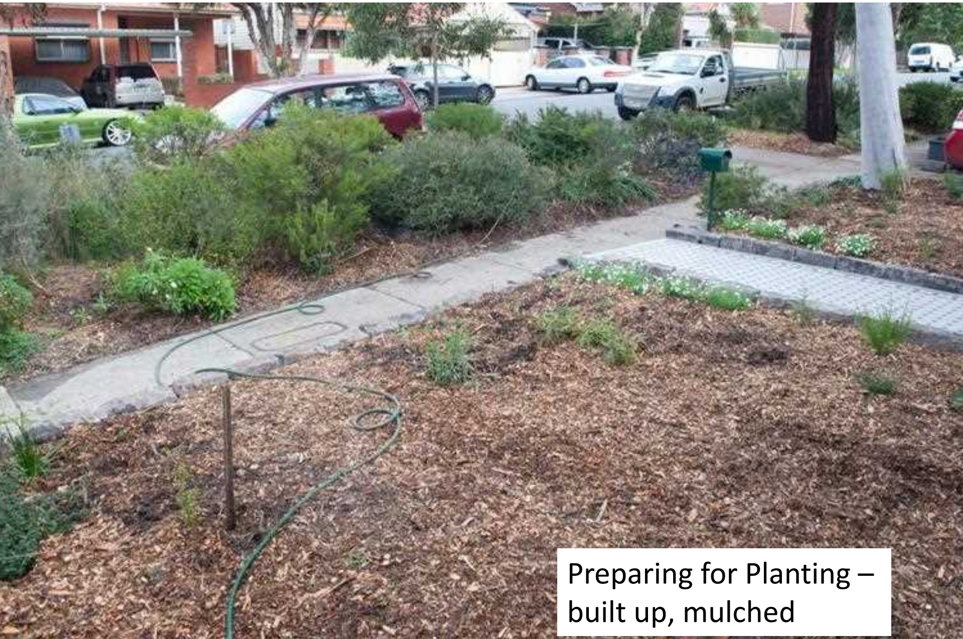
Preparing for Planting – built up, mulched