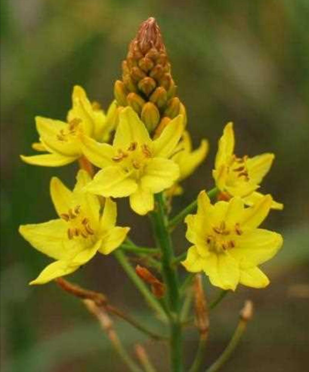
Lilies – Bulbine bulbosa (Colleen M)