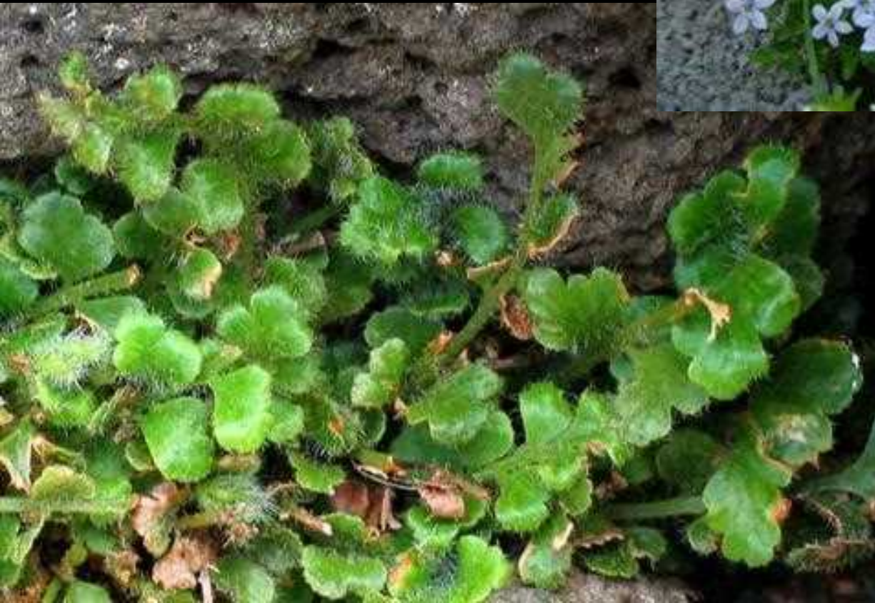
Pleurosorus rutifolius Blanket Fern