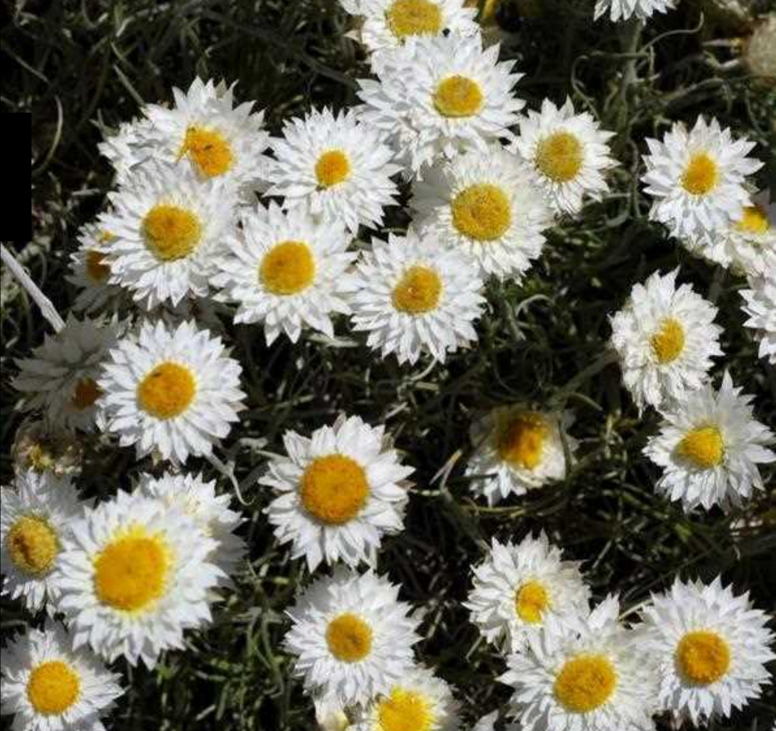
Rhodanthe anthemoides Chamomile Sunray